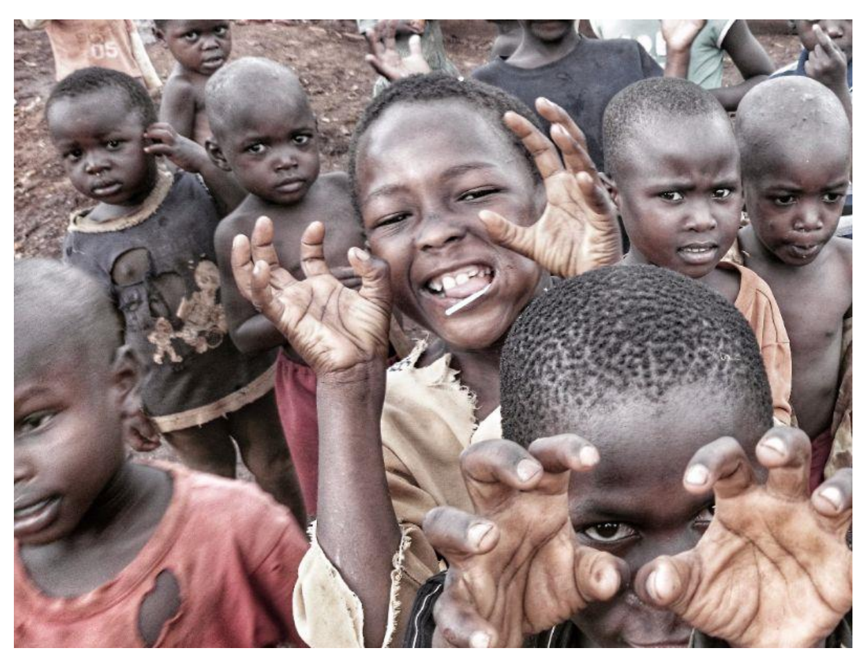
Children from the neighbourhood