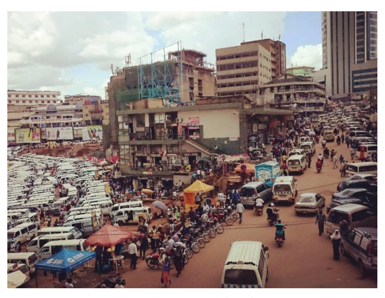
Central bus station in Kampala (Uganda)